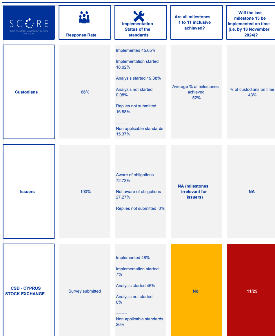
Figure 1 Summary of the monitoring exercise