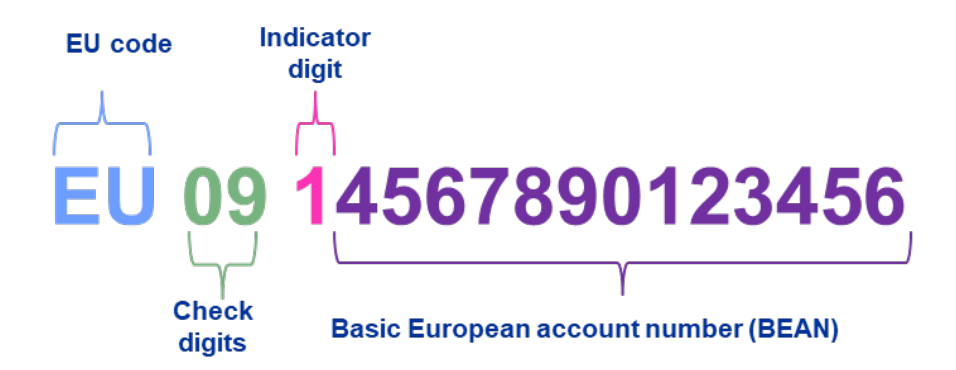
Figure 6 The characteristics of the digital euro account number

Workstream G4 defines back-end implementation specifications that include an overview of DESP interfaces, message types and applicable data elements.